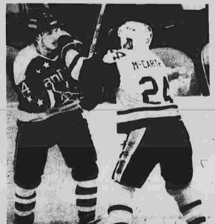
Washington's Gaetan Duchesne gets hit on the side of the head by Penguin Kevin McCarthy during first period action Monday in Pittsburgh. No penalty was called on the play. The Capitals won the game, 5-2.

Ewing needn't lay awake nights worrying. His scoring, rebounding, shot-blocking abilities and the way he enjoys the bump-and-grind style necessary for international competition will make him a favorite of Knight. Besides, Georgetown coach John Thompson is on the selection committee.